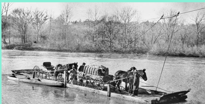
19<sup>th</sup> century ferries – rope style