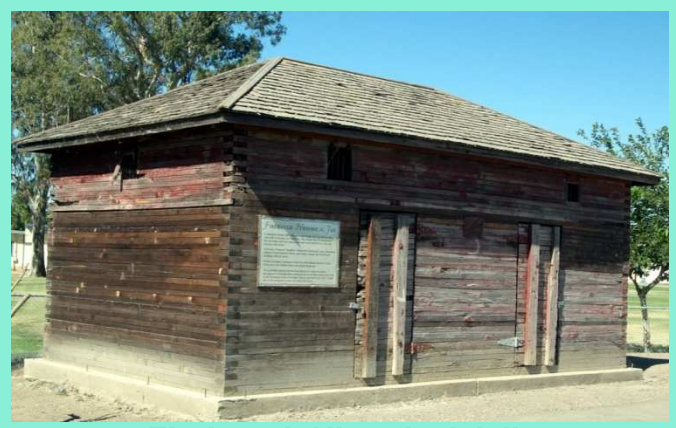
Firebaugh Historical Jail

Completed around 1885, this jail is one of only two Lincoln-log style jails still in existence in California. This unique type of construction has no frame and uses square nails and wood plank floors. The jail has two cells inside. In its day, it housed "banditos" along with Firebaugh's more disorderly citizens. It also housed a fierce, gun toting woman who lived in the building with her goats. On one occasion, a prisoner broke free after friends hitched a team of horses to the window bars and yanked them out. The partially restored jail had been placed at various locations throughout Firebaugh before being moved to its final resting place at the Firebaugh Rodeo Grounds, which is east of its original site on the northwest corner of P and 13th Street.